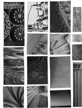
Collage Sheet by Becky F.

Images – photographs, movie stills, posters, art prints