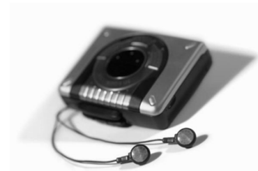
Sound Recordings – audio cassettes, audio CDs, MP3s

Fair use may also be available as exception permitting the streaming of audio to online classes.