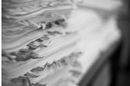
Textual materials (book chapters, journal articles, poems, web site content)

Post-It