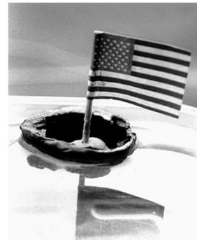
America in a Nutshell by Vermario (Flickr.com CC-BY-NC-SA)