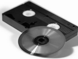
Video materials – VHS, DVD, streaming video